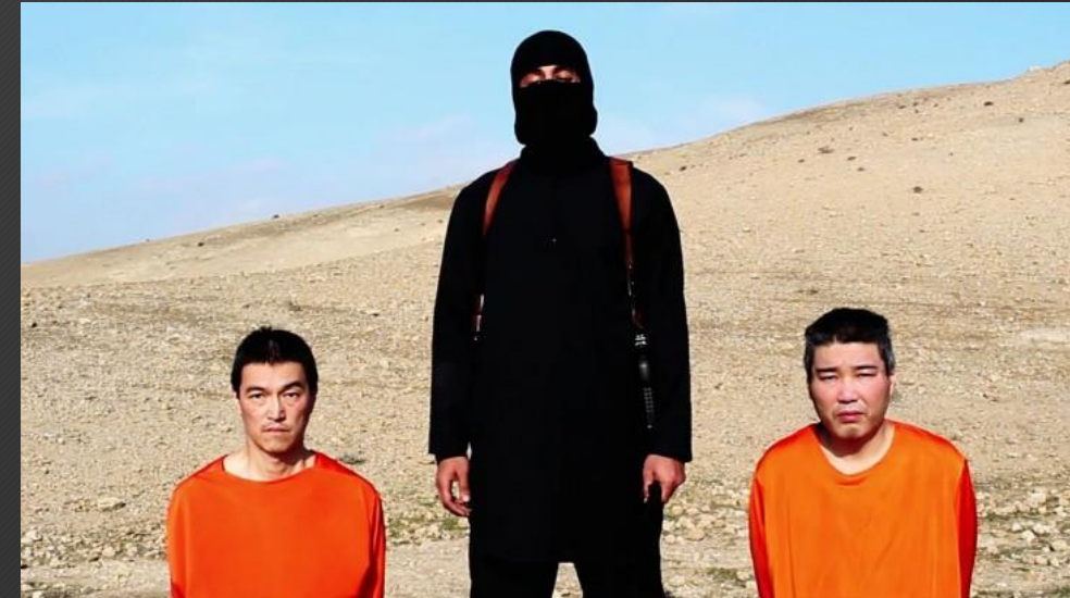
Video released Jan. 20, 2015 threatening to kill Japanese hostages unless $200 million ransom is paid