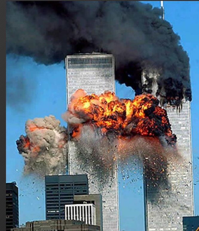
World Trade Center, 2001