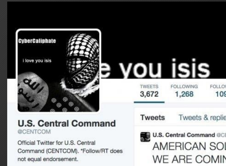
US Central Command hacked by ISIS, Jan. 2015